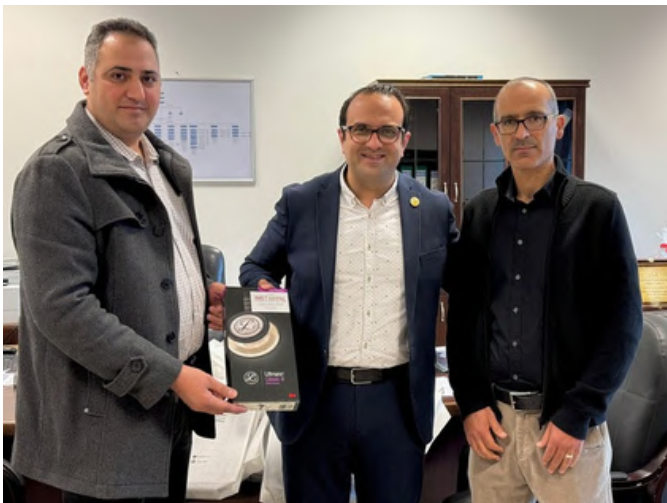
An-Najah National University

This initiative programme comes as part of the commitment of IMET2000 to develop the health sector in Palestine by investing in the next generation of doctors and enhancing their practical experience in a way that contributes to achieving their professional aspirations.