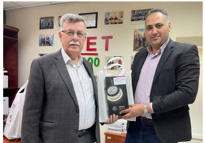
Palestine Polytechnic University