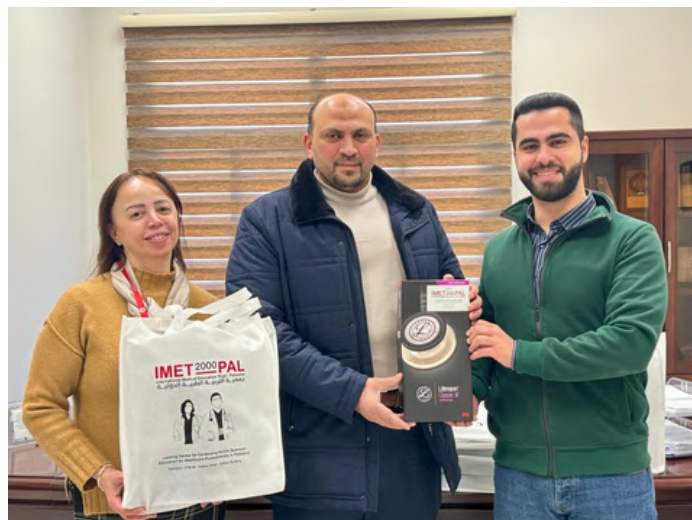
Arab American University