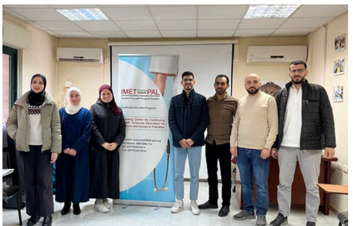
25,26/11/2024 IMET2000-Pal Training Centre