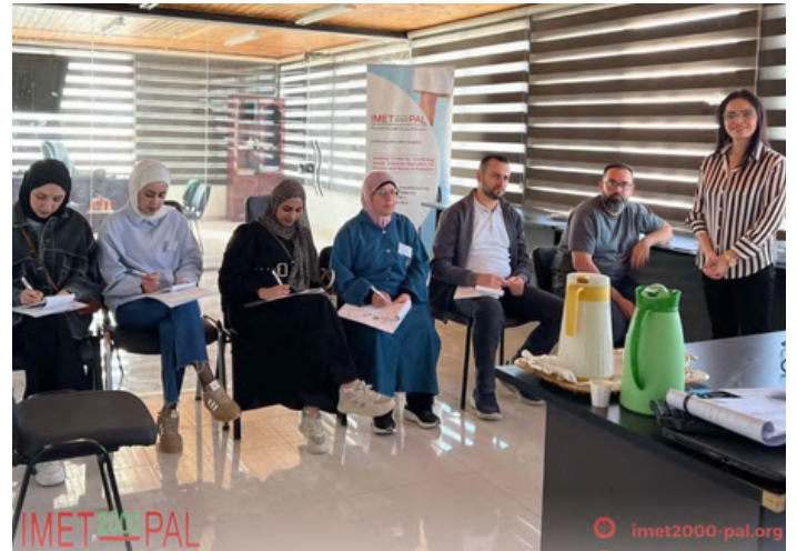
11,12/11/2024 Al Amal Hospital

Second Workshop (25&26 November 2024): Held at the IMET2000-Pal Training Centre, this workshop trained six doctors and nurses from various hospitals, emphasising skills in managing cardiac and respiratory emergencies, airway and stroke management, and team leadership.